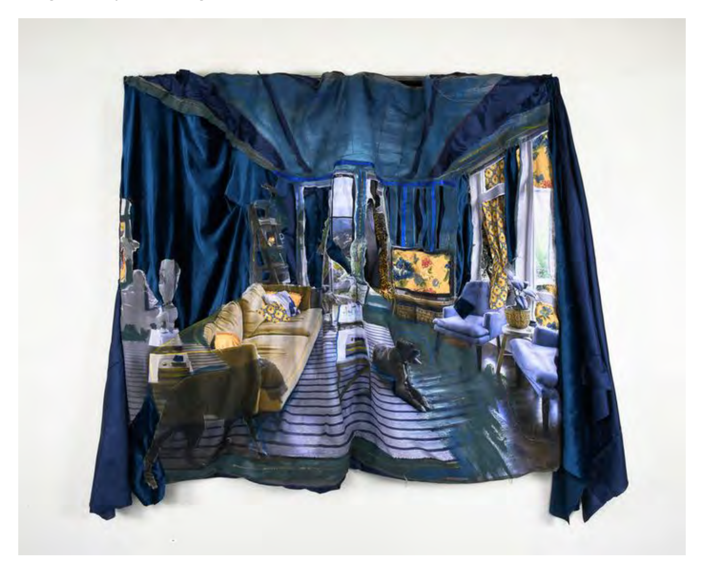
"Echo," a mixed-media tapestry by Alexis Day.

Though 2019 has been a bit of a slog, shows that open 2020 give the new decade a fresh start. A common thread in the exhibitions opening the new year is, of all things, beauty. Cerebral work around science and the environment at Upfor Gallery fits into this category, as does a show of quietly exuberant landscape painting opening in March at PDX Contemporary Art. Under the direction of a new curator, the Portland Japanese Garden will offer a year of thoughtful programming focused on peace to commemorate the end of World War II. And across the city, artists working in widely divergent mediums and subjects bring new ways of looking at the world.