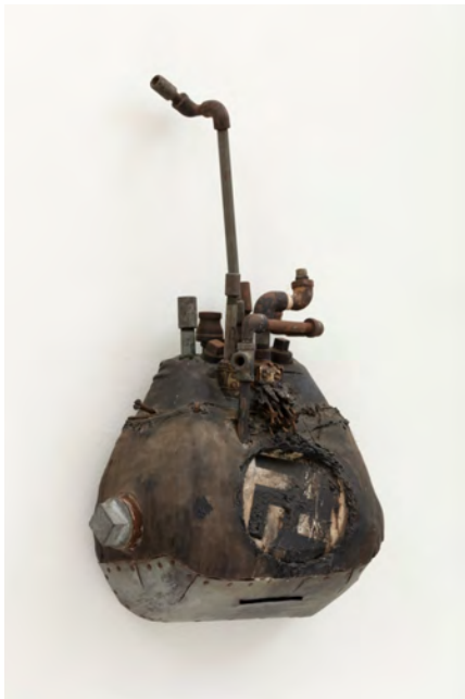
Ed Bereal “Focke-Wulf FW 190” (1960) mixed media, 21 ¼ x 12 x 6 inches, the Buck Collection at the UCI Institute and Museum for California Art (© 2018 the Regents of the University of California)

Considering Bereal first made a name for himself with small, gritty assemblage pieces featuring nails and pipes (and sometimes swastikas, Bereal was fascinated by the graphic punch of Nazi propaganda) such as “Focke-Wulf FW 19” (1960), Bereal’s cursed journey has already been long.