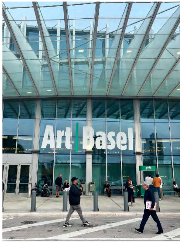
The entrance to Art Basel Miami.

Sometimes, the diversity in vintage, style and subject occurs within a single Art Basel booth. This is the case at Aquavella Gallery of Palm Beach and New York, where works by Picasso and Francis Bacon share wall space with Jackson Pollock, Keith Haring and others.