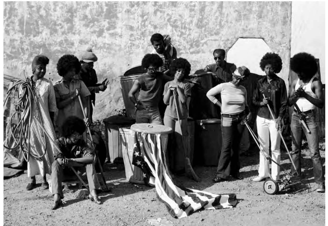
Untitled (Bodacious Buggerilla, photographic documentation), ca. 1968-1975