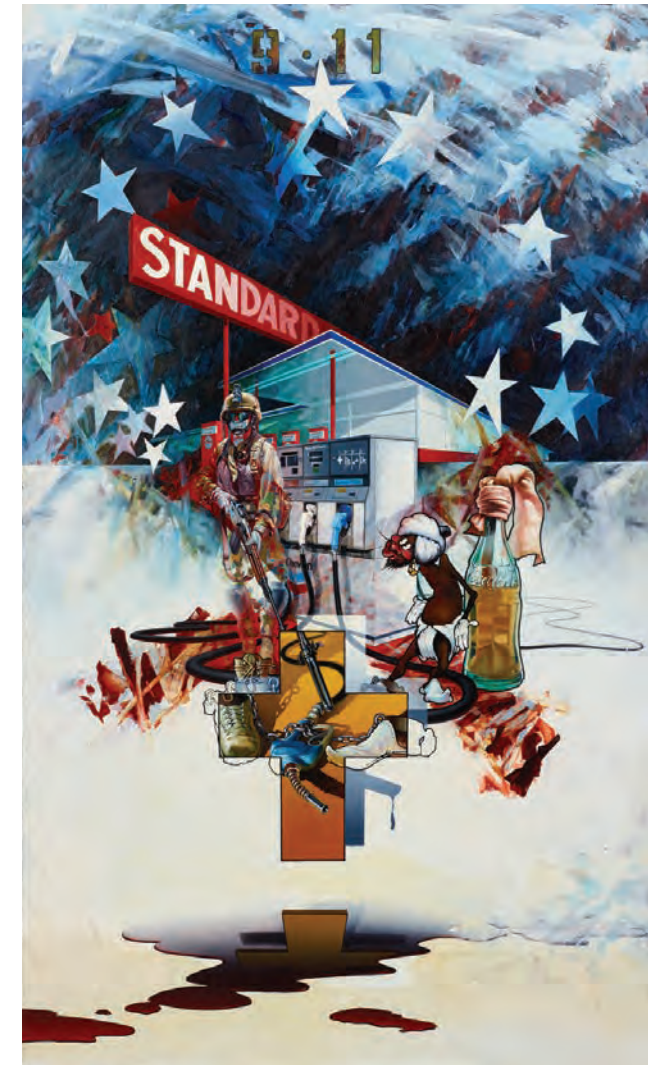
Location, Location, Location (Iraq/Afghanistan), 2006

So, naming a quiz show, that's basically pulling the audience's coattail and letting them know, particularly because the questions and answers all relate to sociopolitical issues of the day, and you do it in a very satirical way. Satire