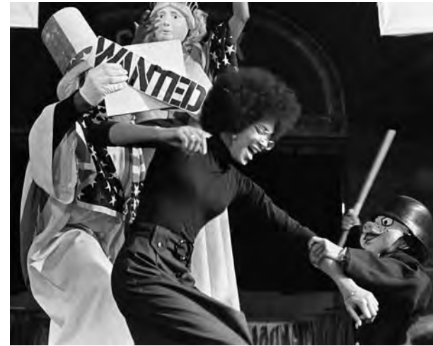
Untitled (Bodacious Buggerilla, photographic documentation), ca. 1968-1975

So I go, whoa, how do I take one medium, pass the idea of the piece to another medium, and imperceptibly, so that you can't see it, but now you're going from metal to plastic, or you're going from opaque to transparent. And, wow, that's