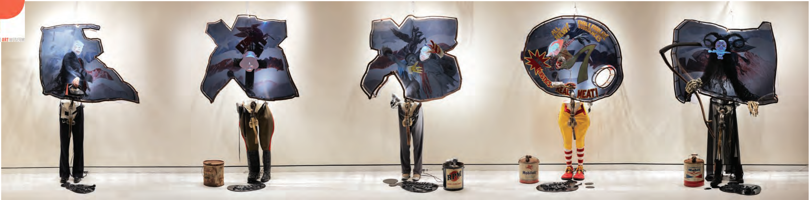
EXXON: Five Horsemen of the Apocalypse, 2011–2019