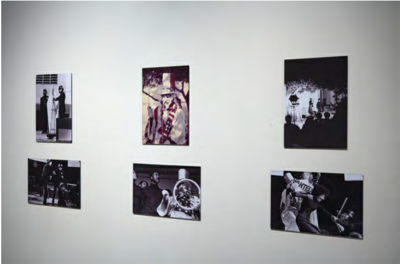
Untitled (Bodacious Buggerrilla performance stills) (c. 1968–1975) archival digital prints