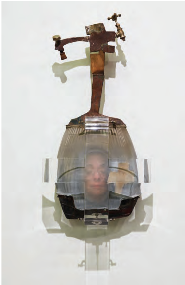
Immortal Beloved, 1962/2015

GKA: In Separate but Equal , what stands out for me is the terror in the children's faces. The American flag is just falling apart, becoming untethered. And there's this sort of robotic hand, part of a kind of zombie robot or nightmarish Lady Liberty coming forward. Can you talk about some of that recurring imagery?