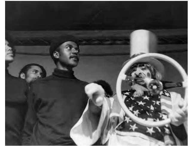
Untitled (Bodacious Buggerilla, photographic documentation), ca. 1968-1975