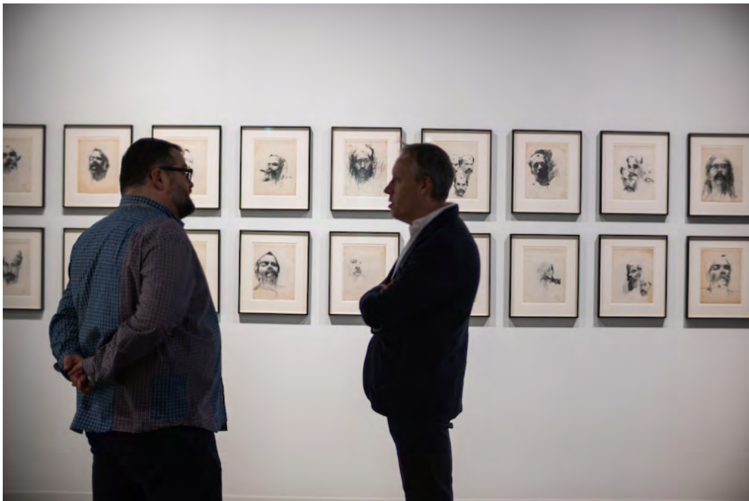
Featured image: Installation view Elizabeth Leach Gallery exhibits works by Ed Bereal.