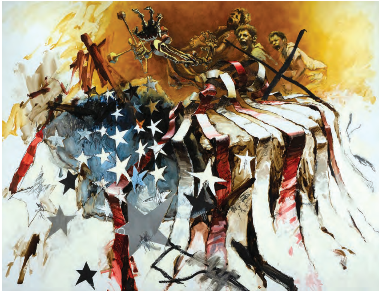
Separate but Equal, 1988-99

a kind of interesting idea. And I love it, and let's play with that for a bit.