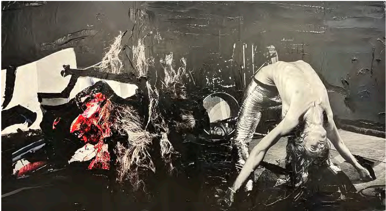
Arthur Jafa's untitled work that proceeds from a photograph of Iggy Pop's famous backbend pose.

In the series presented here, Tompkins harvested photographs from books on vintage softcore portraiture like Wheels and Curves: Erotic Photographs of the Twenties which she combined with her own oil crayon renderings of idyllic landscapes. The results are works that make laughable the evolution of censorship and shrill public distress over nudity in art.