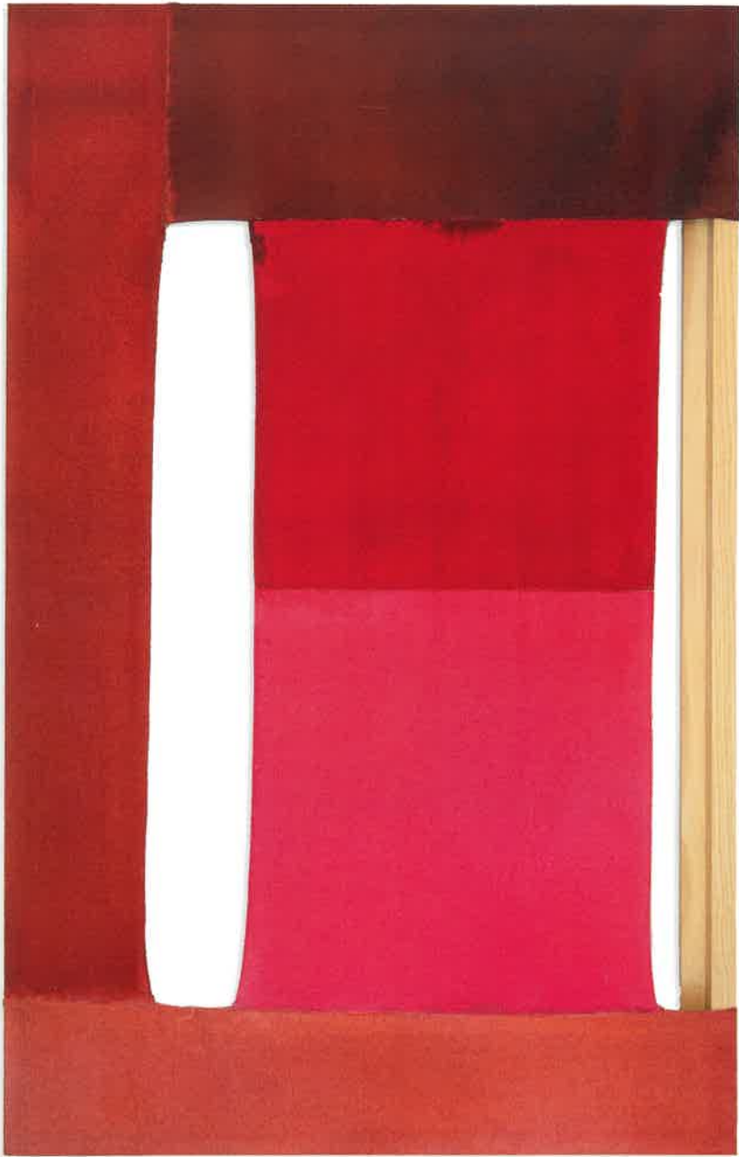
Red Window acrylic on sewn Kwangmok (Korean Muslin), 35 x 22 inches