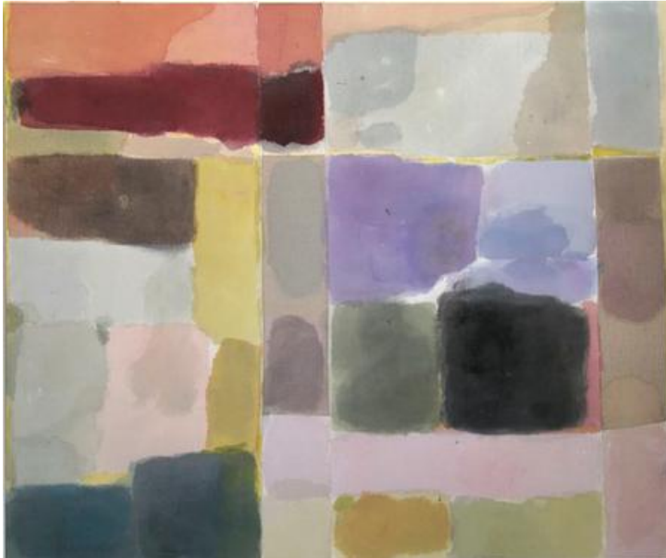
Jinie Park, "Yellow Beans," 2017, acrylic on sewn linen and canvas, 60 x 72"