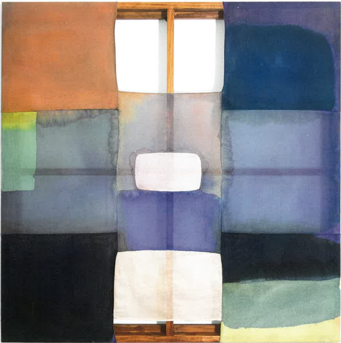
Light Evening acrylic on sewn Kwangmok (Korean muslin) and cheesecloth, 36.5 x 36.5 inches