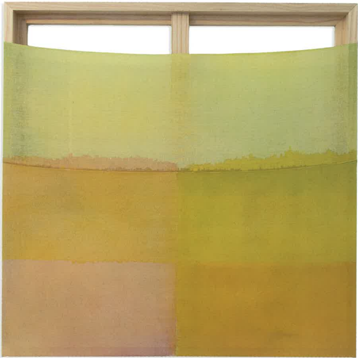
Moth acrylic on sewn Kwangmok (Korean muslin) and linen, 30 x 30 inches